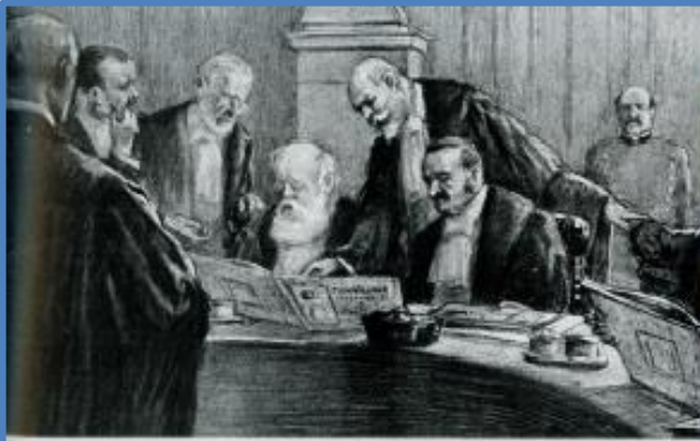
LE PROCÈS DE « MON VILLAGE » Les juges de Leipzig cherchant la haute trahison dans les pages de l'abbé de Hansi. Dessiné par Jean Jacques WALTZ