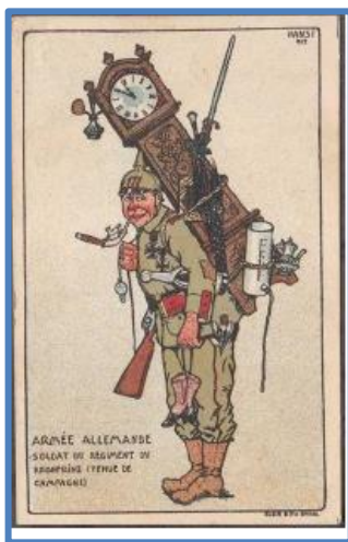
CARICATURE ANTI-GERMAN (HANSI)